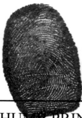
LEFT THUMB PRINT