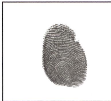
Defendant's Right Thumbprint