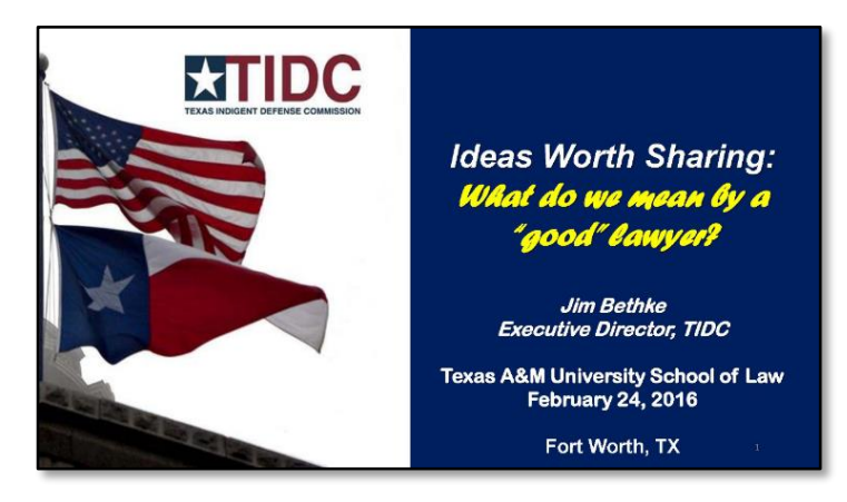
<u>Texas A&M University School of Law - Ideas Worth Sharing: What do we mean by a "good" lawyer?</u> (February 2016)

<u>Waller County Commissioners Court briefing</u> (February 2016) Criminal Justice Division, Office of the Governor - Report on State of Indigent Defense (April 2016)