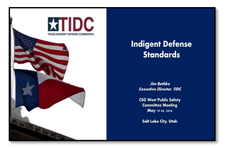
<u>Council of State Governments – West, Public Safety</u> <u>Committee Meeting - Indigent Defense Standards</u> (May 2016)