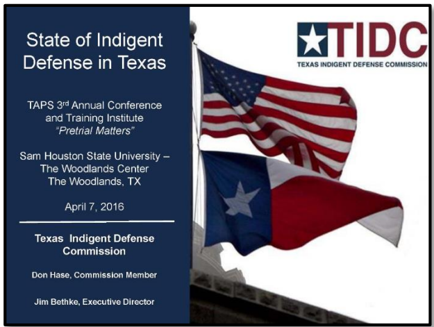
<u>Texas Association of Pretrial Services Annual</u> <u>Conference & Training Institute - Pretrial</u> <u>Matters</u> (April 2016)