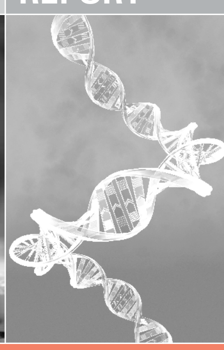
Making Sense of DNA Backlogs — Myths vs. Reality