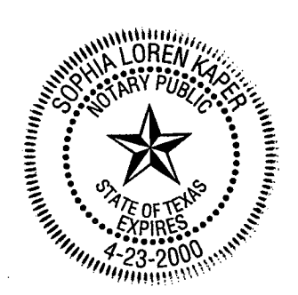
NOTARY PUBLIC in and for the State of Texas