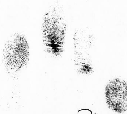
DEFENDANT'S Rt. HAND

THIS IS TO CERTIFY THAT THE FINGERPRINTS ABOVE ARE THE ABOVE-NAMED DEFENDANT'S FINGERPRINTS TAKEN AT THE TIME OF DISPOSITION OF THE ABOVE STYLED AND NUMBERED CAUSE.